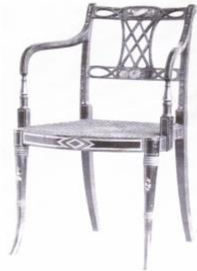
Lattice back chair