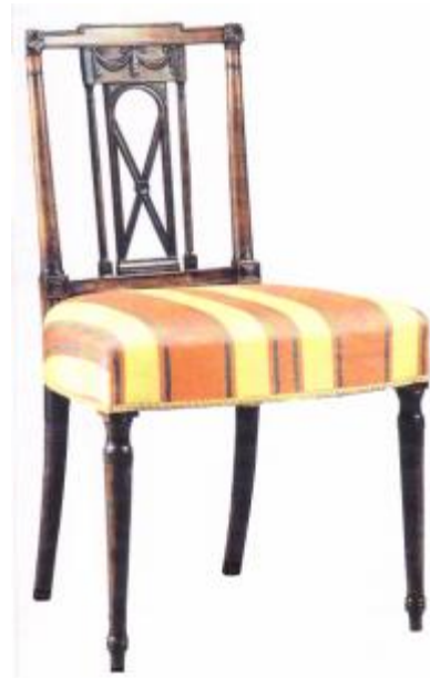
Lattice back chair