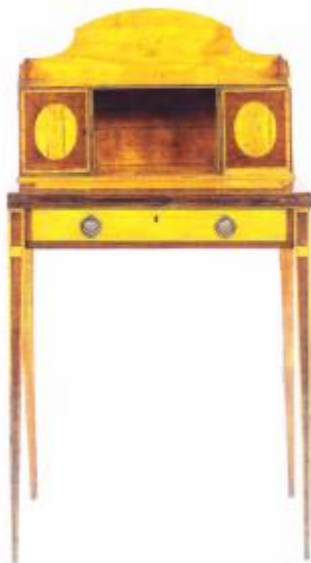
Bonheur –Du Jour Ladies writing table