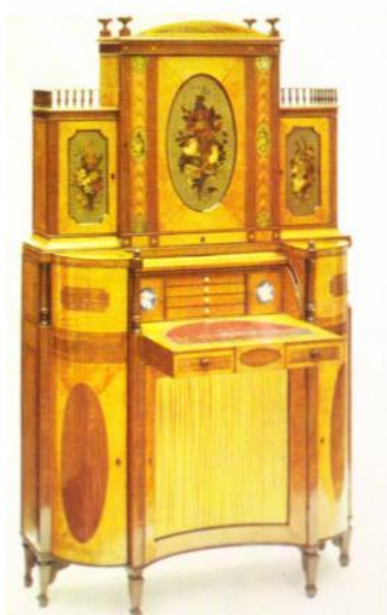
Ladies writing table